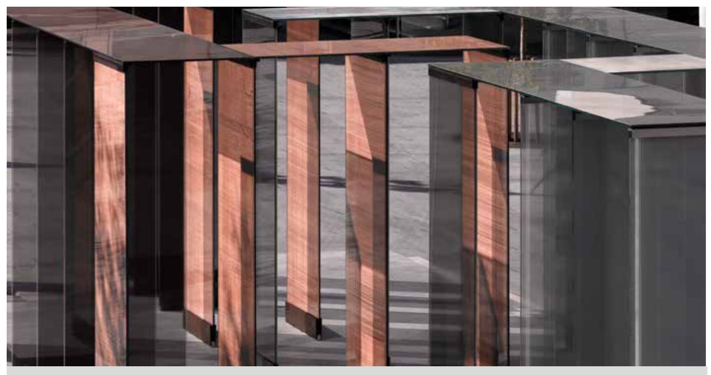
Situated at the Southbank Centre Square, London, the 28 identical vertical laminated glass panels with SentryGlas<sup>®</sup> ionoplast interlayer have fabric inserts with copper and aluminum coatings that ensure the strong, material-like appearance of the glass surface and create different visual experiences both inside and outside the installation.

The installation "Two Lines" by David Chipperfield Architects delighted and intrigued visitors to Size+Matter at Southbank Centre, one of the cornerstones of the 2011 London Design Festival. For this sensational construction, the highly renowned London architecture practice used laminated glass with SEFAR® Architecture Vision - a new and innovative fabric with a single-sided metal coating made by Swiss corporation, Sefar AG.