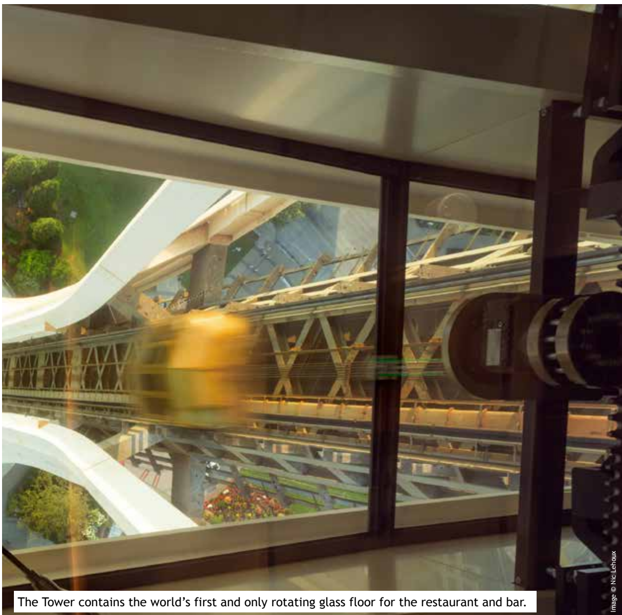
The Tower contains the world's first and only rotating glass floor for the restaurant and bar.

Green concludes: “The next big thing on the horizon is the creation of a standard that will allow architects and engineers to design and use glass as a ductile failure mechanism; the idea being that you can design a structure to be reliable even if the glass breaks – that’s one of the things that has made this project work. Using SentryGlas® we were able to exploit large glass panels with simple and slender mounts, because the glass just works... even when it’s broken. Without that level of assurance when broken, the glass would have needed more support, which would ultimately have impacted the viewing experience.”