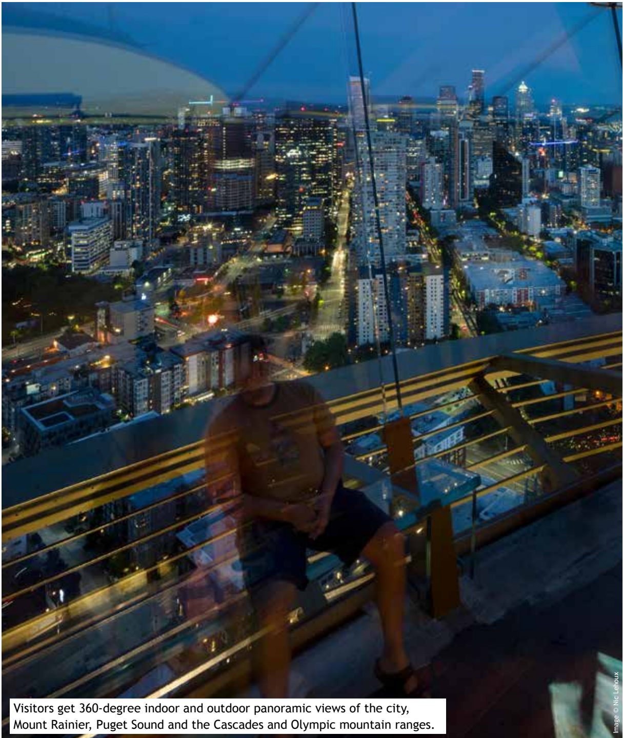
Visitors get 360-degree indoor and outdoor panoramic views of the city, Mount Rainier, Puget Sound and the Cascades and Olympic mountain ranges.

The Loupe glass floor is probably the most impressive. From the bottom upwards it comprises two 6 mm (0.24 in) low-iron glass panes on either side of a 1.52 mm (60 mil) SentryGlas® interlayer. A 20 mm (0.8 in) Argon gap separates this laminated panel from another, which comprises three 10 mm (0.4 in) glass panels sandwiching two 2.28 mm SentryGlas® interlayers. Completing this panel is a 0.2 mm (0.008 in) clear safety film and a 6 mm glass pane.