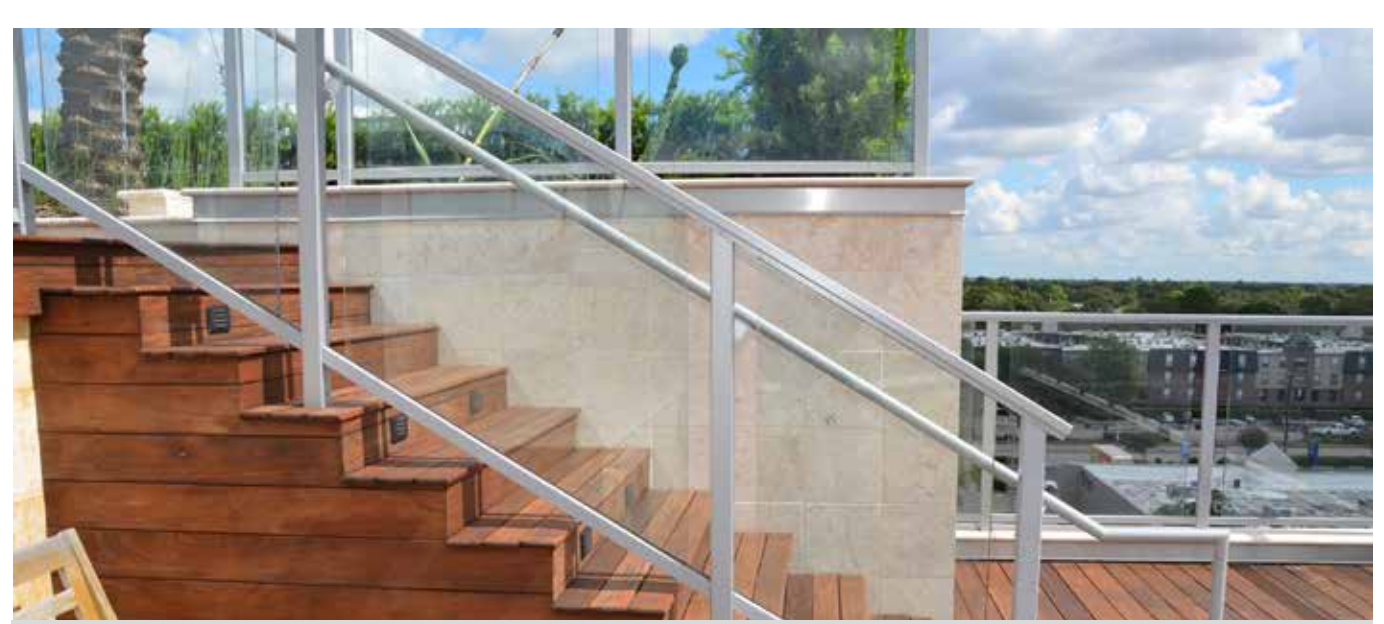
CRL's 200 Series ARS Aluminum Railing System was retrofitted to the pool deck areas at Kirby Drive. SentryGlas® was chosen because it is safer and stronger than alternative laminates and is extremely clear, giving residents virtually crystal clear, unobstructed views from their balconies. SentryGlas® also offers excellent weathering durability with no discolouration, creep or delamination issues.