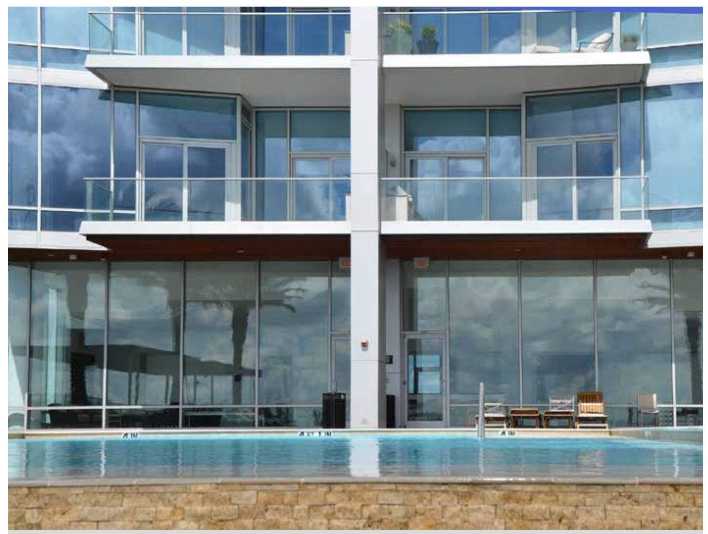
The frameless glass railing system installed at 2727 Kirby Drive, a 30-storey luxury condominium tower block in Houston, Texas. 143 balconies were retrofitted with C.R. Laurence's patented CRL L56S Series TAPER-LOC® Glass Railing System and SentryGlas® ionoplast interlayers.

Sentryglas® ionoplast interlayer provides safer, stronger, more durable glass railing system for Kirby Drive Tower in Texas