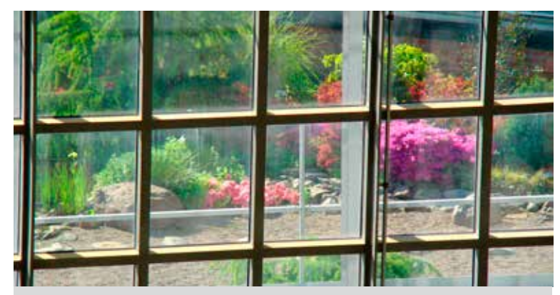
Double-glazed, insulated glass panels address safety requirements and plant health needs.