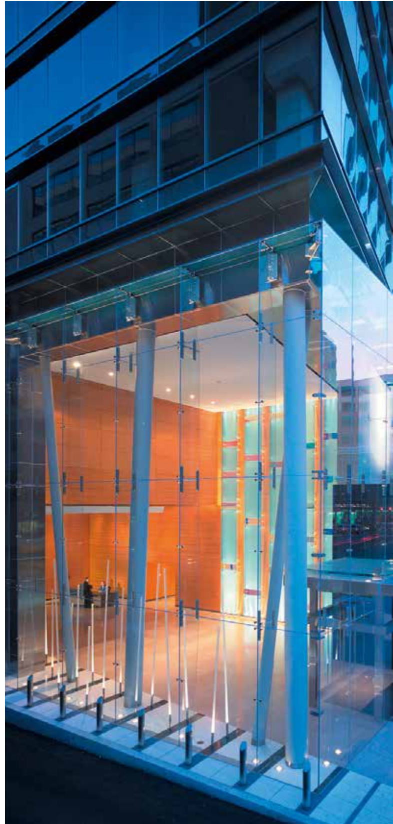
The Columbia Center high-rise building in Washington DC, USA.

SentryGlas® was chosen as interlayer for the glass façade due to its thinner, lighter qualities and for its open edge stability.