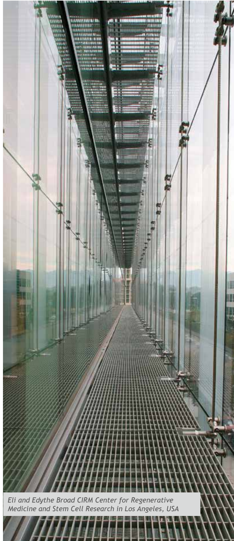
Eli and Edythe Broad CIRM Center for Regenerative Medicine and Stem Cell Research in Los Angeles, USA

Independent tests have proven that the Planar™ | SentryGlas® interlayer system has residual strength, even with both glass components broken. In locations where typhoons or hurricanes are a potential risk, this offers greater peace of mind for the end user and also makes it possible to specify laminated glass for canopies, skylights and exterior glass railings, thereby providing protection from falling glass if breakage should occur.