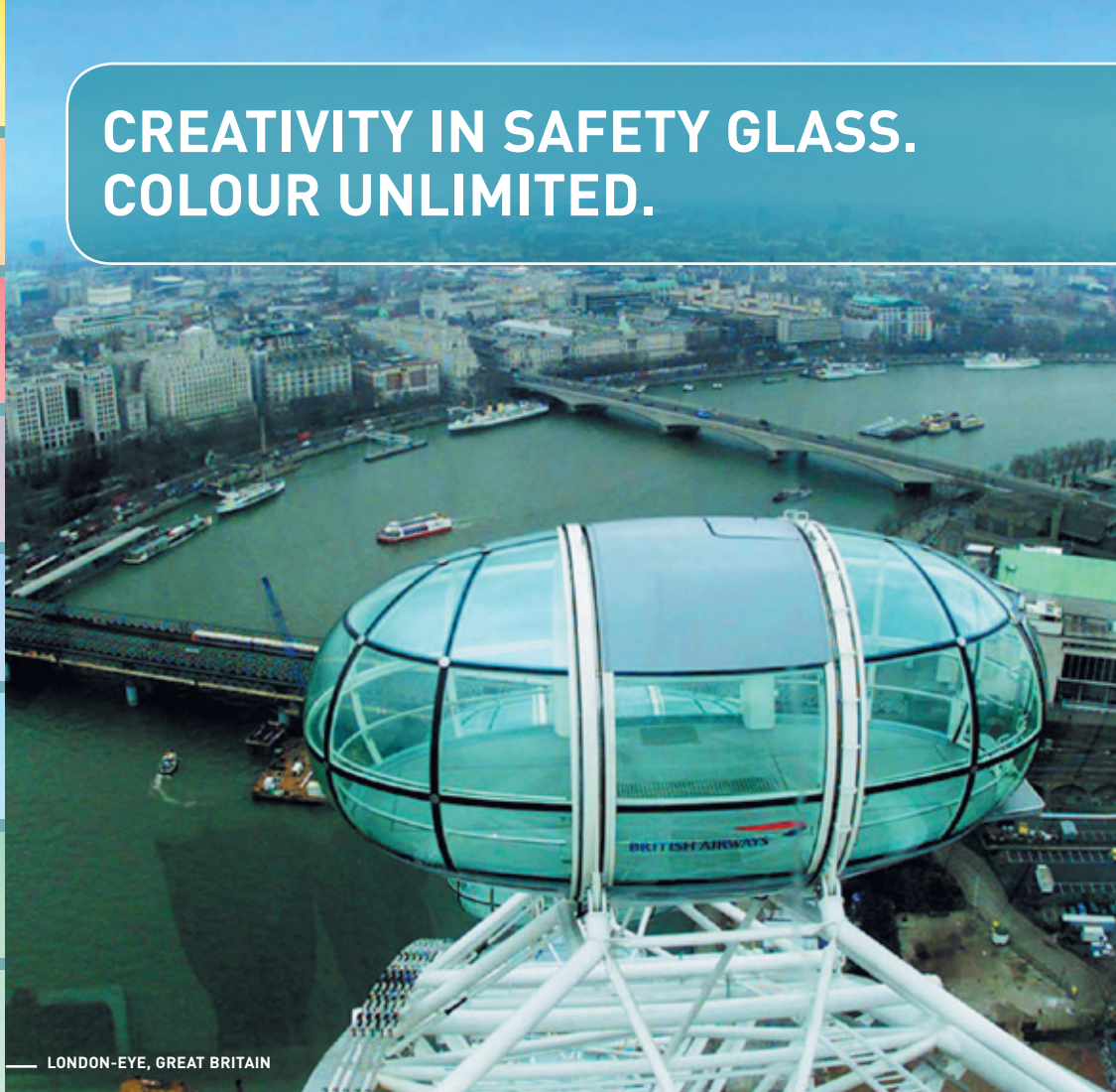
LONDON-EYE, GREAT BRITAIN