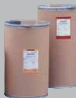
Drum packages – vertical