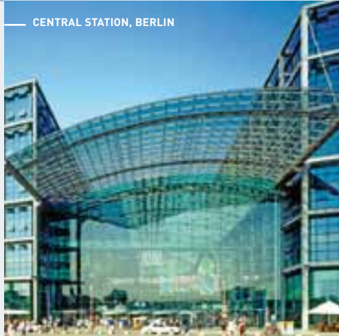
CENTRAL STATION, BERLIN