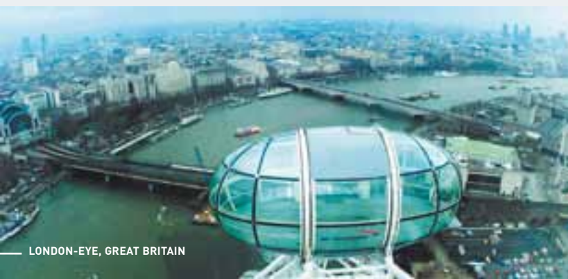
LONDON-EYE, GREAT BRITAIN