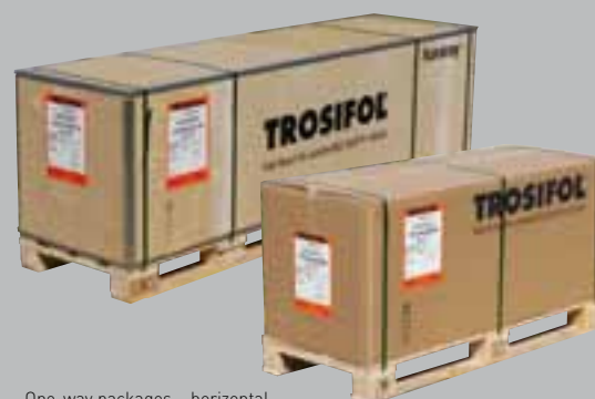
One-way packages – horizontal