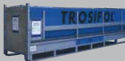
Multi-way packages – horizontal